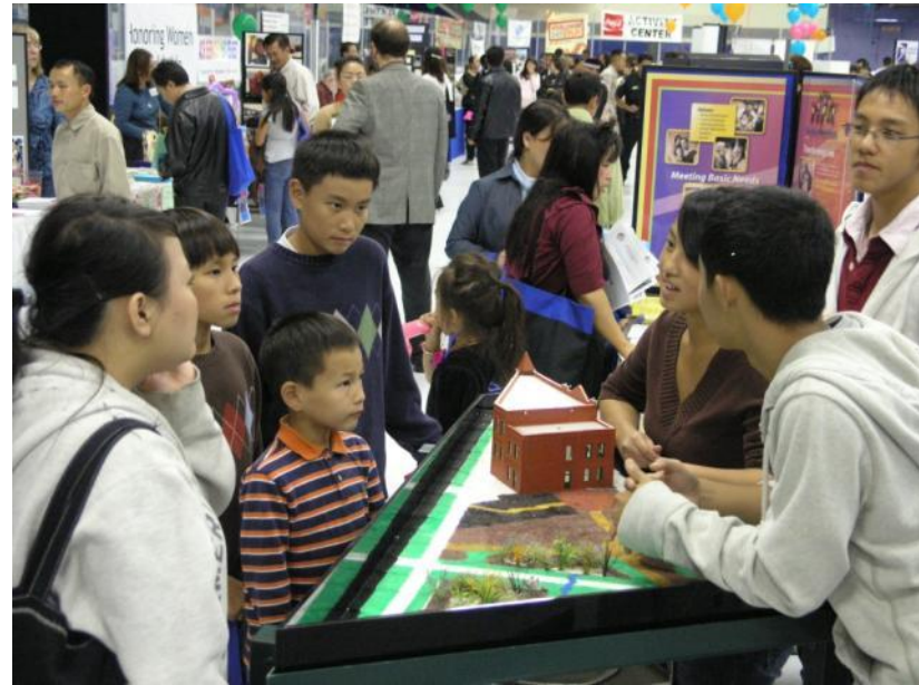
Explaining a raingarden at the Hmong Resource Fair