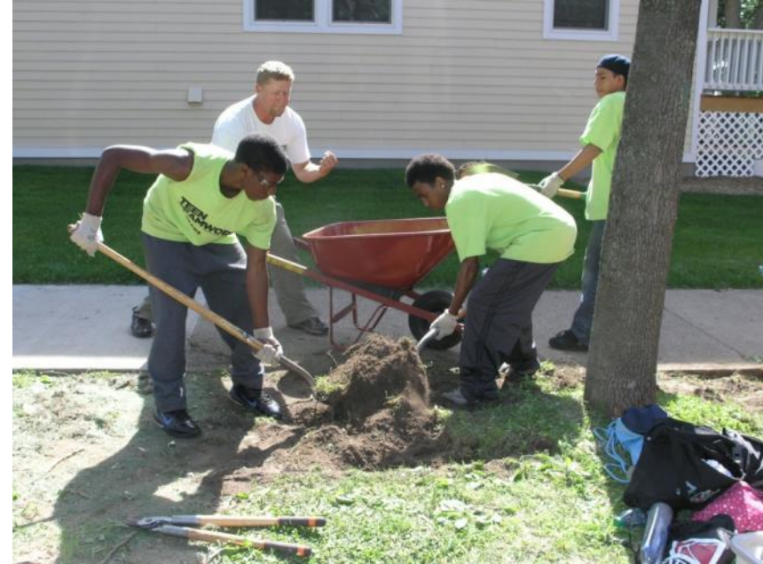
Mississippi River Green Team installing a rain garden