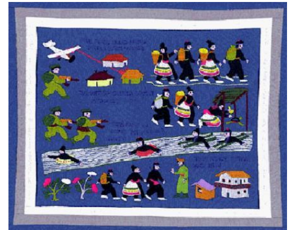
Storycloth- Crossing the Mekong River