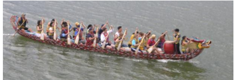
Dragon Boat Festival in Saint Paul, MN