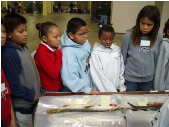
Children at a water festival