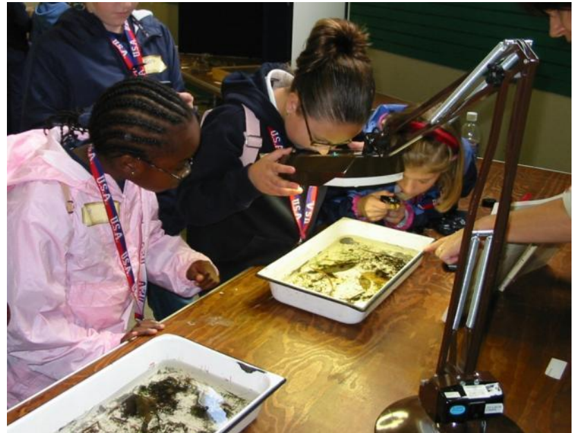
Children at a water festival