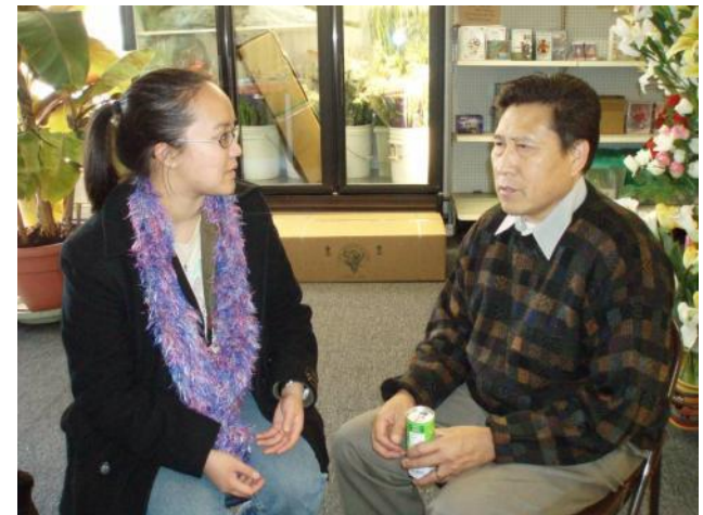
Hmong Study interview