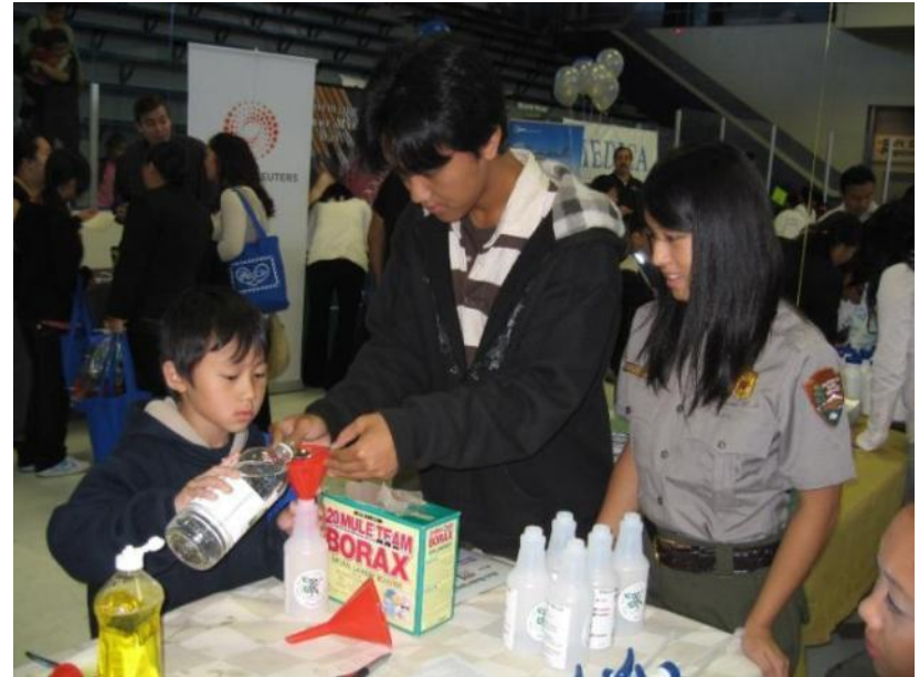
Making non-toxic cleaners at the Hmong Resource Fair