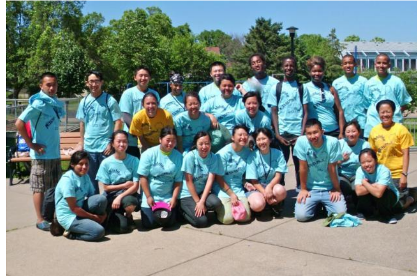
2010 Mississippi River Green Team