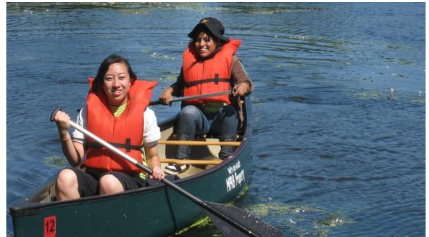
Canoeing on the Mississippi River