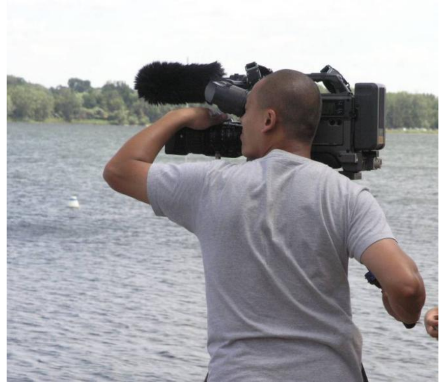
Filming for The Nature of Water DVD