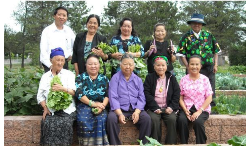
Hmong Elders gardening