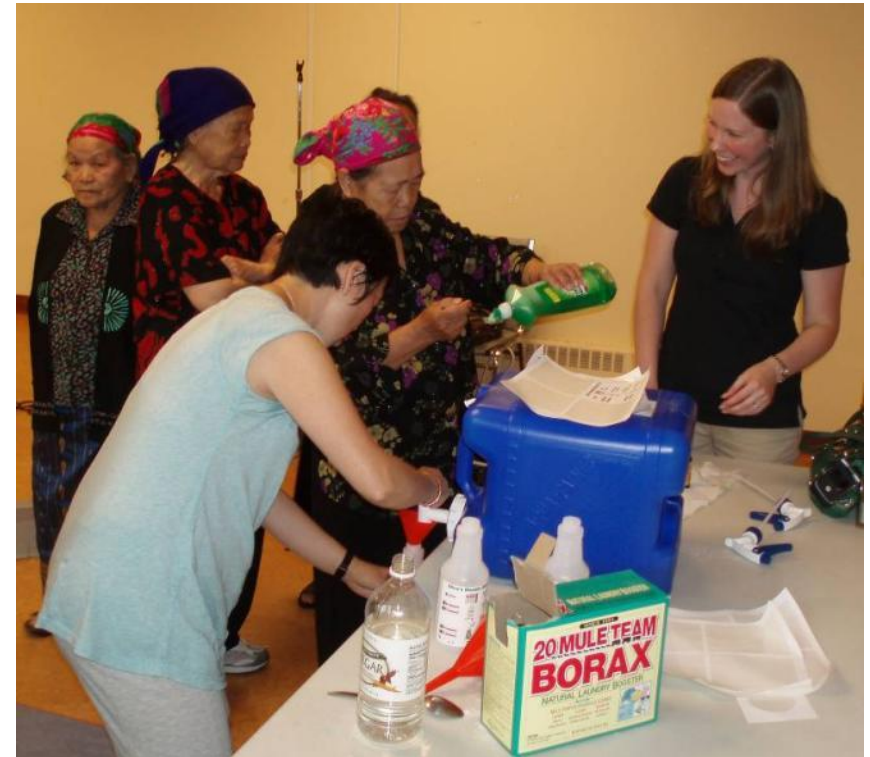
Hmong elders making non-toxic cleaners